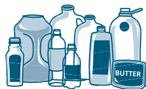
Plastic bottles & containers (Remove lids)