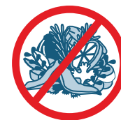
No food waste