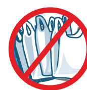
No plastic bags