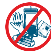
No medical waste