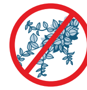
No green waste