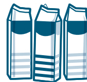
Milk & juice cartons (No silver-lined UHT cartons)