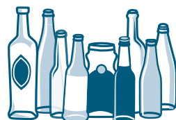
Glass bottles & jars (rinse and remove lids)