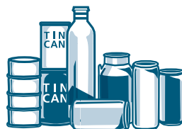
Steel & aluminium cans