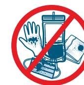
No medical waste