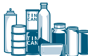
Steel & aluminium cans & empty aerosols