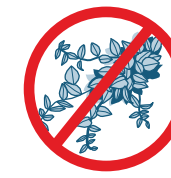
No green waste