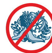
No food waste