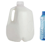
Plastic bottles & containers (no lids)