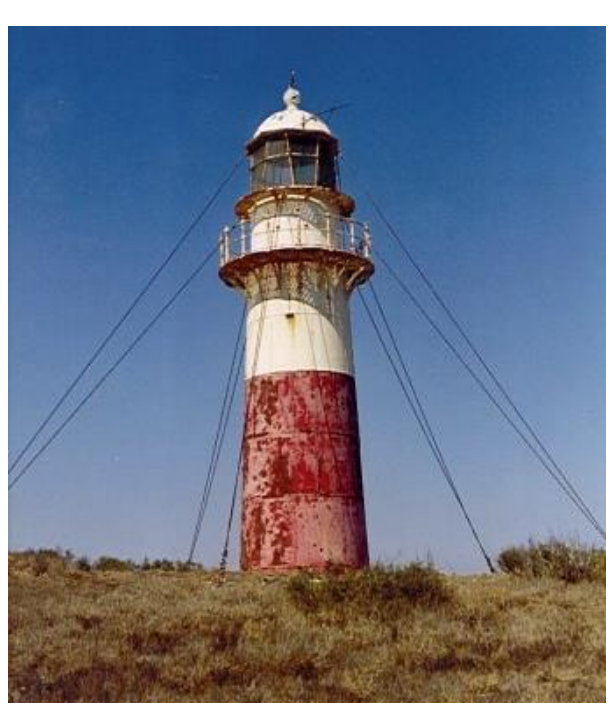
Jarman Island Lighthouse