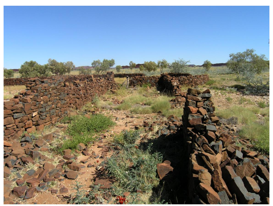
Stone stockyards at Inthanoona Station