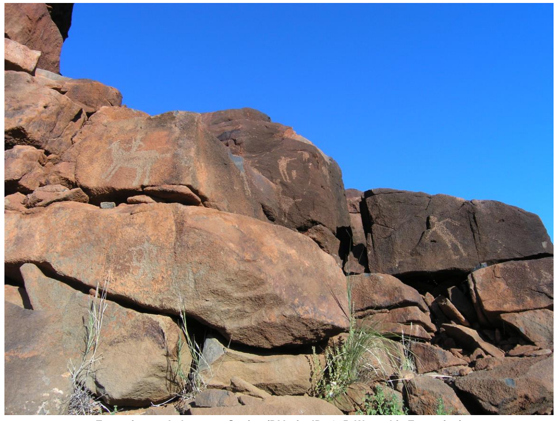
Engravings at Inthanoona Station (DIA site ID 7975, Warambie Engraving)