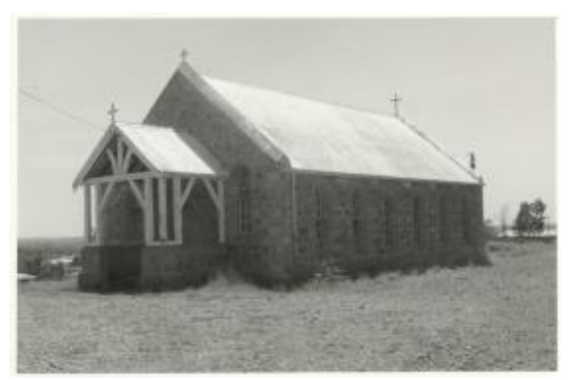
Holy Trinity Anglican Church 1970s