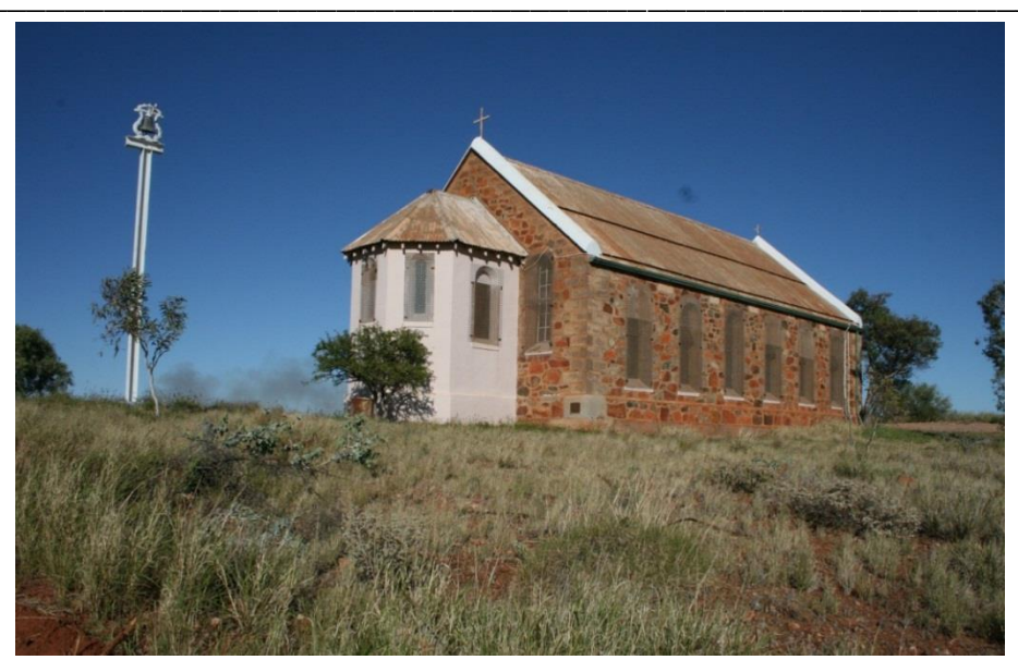
Holy Trinity Anglican Church 2012