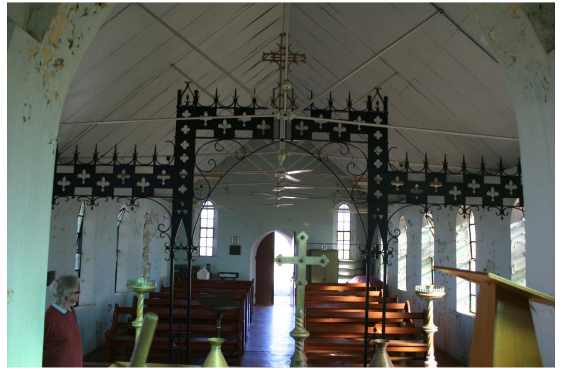
Interior of Church, 2012