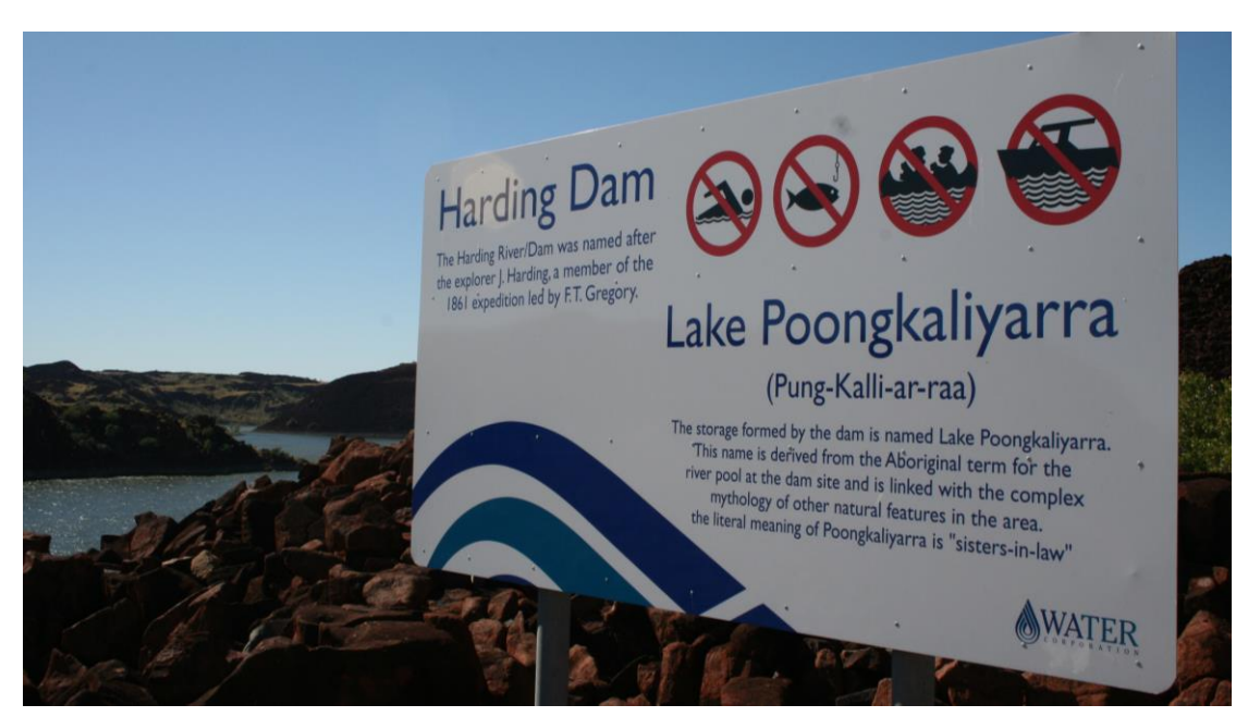
Information sign at Harding Dam/ Lake Poongkaliyarra