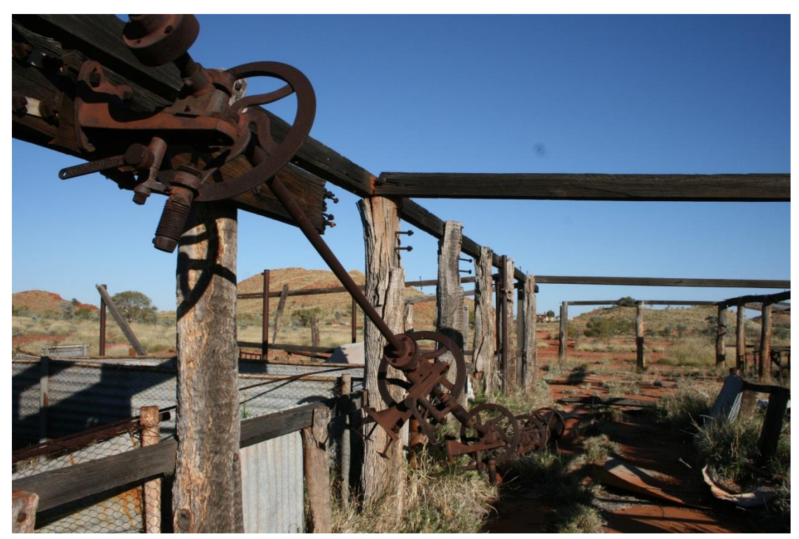
Remains of shearing shed at Croydon Station, 2012

<sup>3</sup> Battye, J.S. 1985, The History of the North West of Australia , Facsimile Edition, Hesperian Press, Carlisle, p 219. <sup>4</sup> Battye, J.S 1912, The Cyclopedia of Western Australia , Cyclopedia Co., Perth.