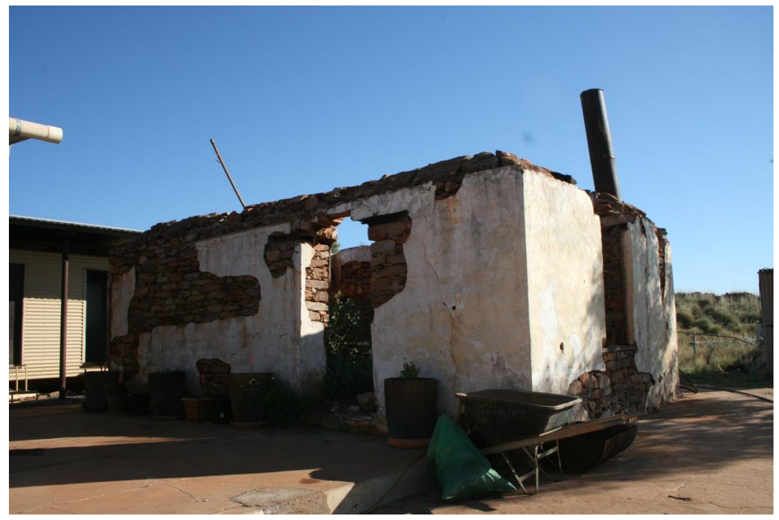
Remains of kitchen at Croydon Station, 2012