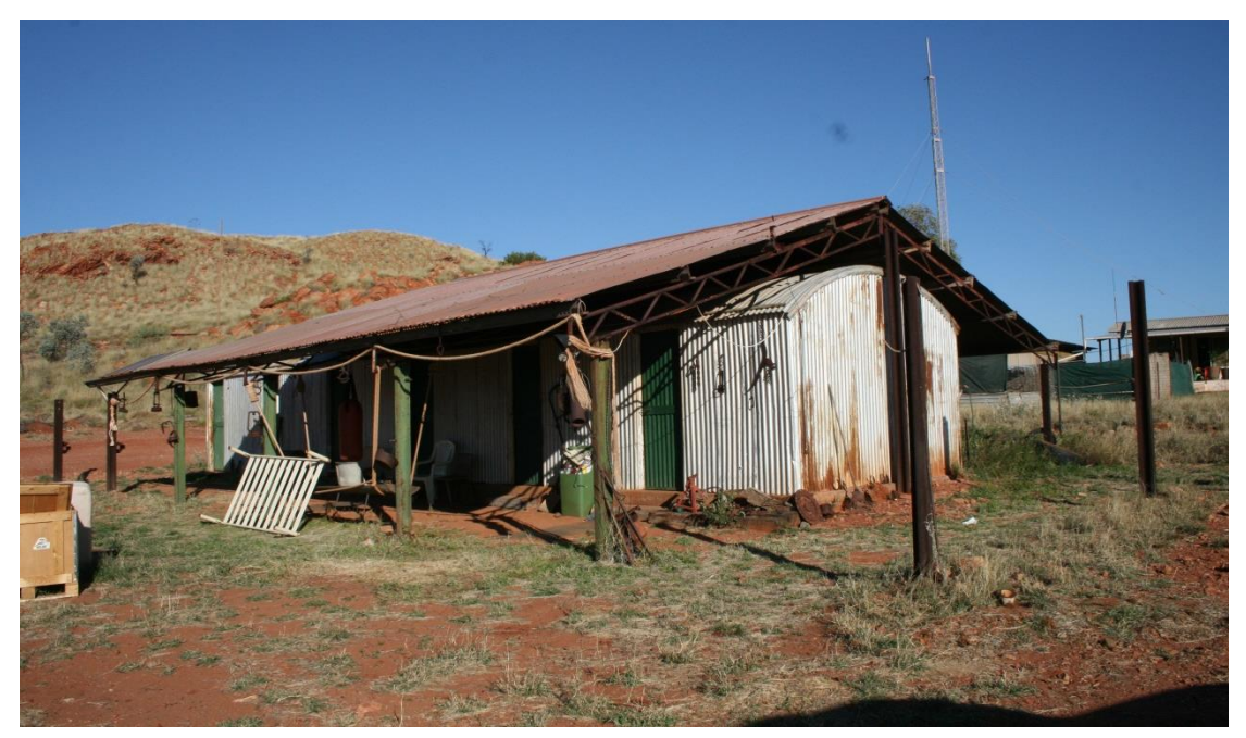
Working sheds with later cyclone protection at Croydon Station, 2012